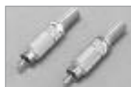
RCA Plug (M) Gold Plated