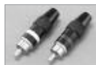
RCA Plug (M) Gold Plated