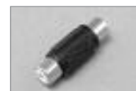
Inline Adapter, Plastic RCA (F) to RCA (F) Gold Plated