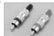
RCA Plug (M) Metal