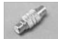
Inline Adapter, Metal RCA (F) to RCA (F) Gold Plated