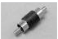
Inline Adapter RCA (M) to RCA (M) Gold Plated