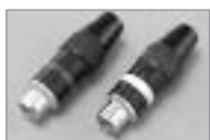
RCA Jack (F) Gold Plated