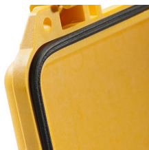
1703 Replacement O-ring