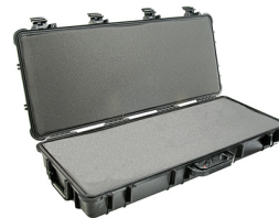
1700WF With Foam