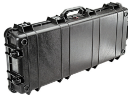
1700NF No Foam