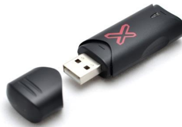
Figure 5.1 FT-X-GPS Dongle

The module has a type A USB connector with dust cap for connecting to the USB host and will be powered from the USB host.