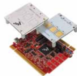
TWRPI Plug-In Starter Kits