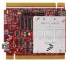
Kinetis Tower System (TWR-K60X256-KIT)

Finally, the decoding layer enables the key detected to be included in a decoder control that treats the detection as a part of the keypad, slider or rotary interface. TSI is an MCU peripheral designed to scan up to 16 electrodes. It is a highly robust touch-sensing method which also minimizes the need for CPU resources to process touch-sensing signals. Conversion time is guaranteed while the resolution is not reduced across typical hardware conditions.