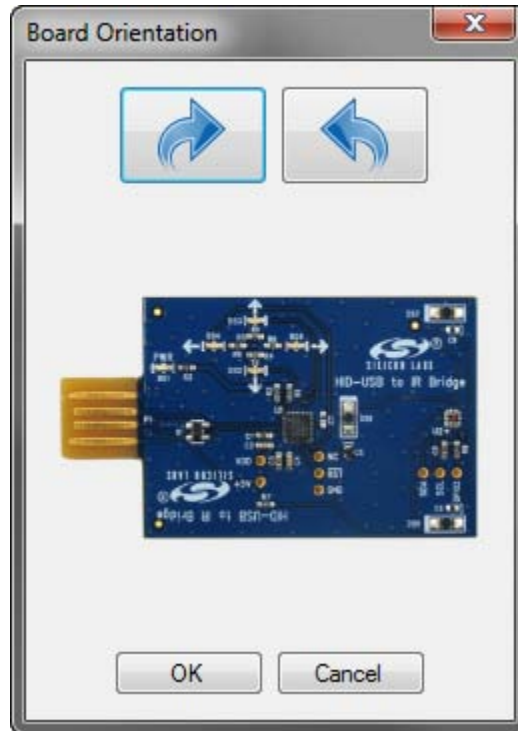
Figure 3. Board Orientation Selection