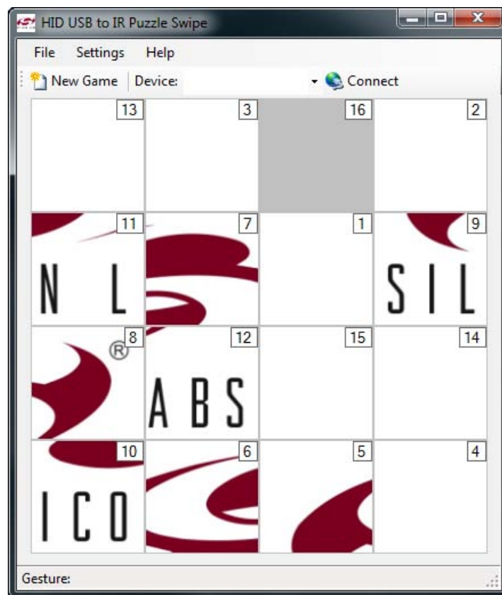
Figure 4. PuzzleSwipe New Game