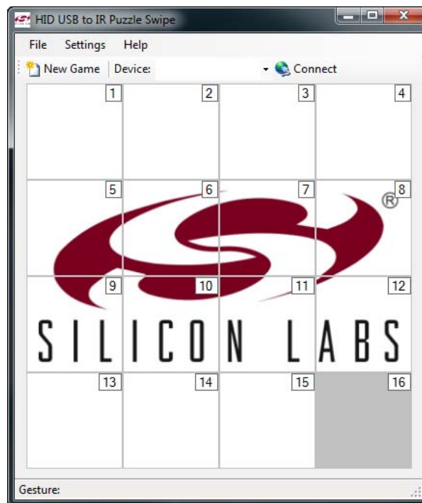
Figure 2. PuzzleSwipe PC Application