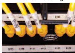
Voice/Data Comm Labeling