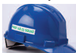
General ID Labels