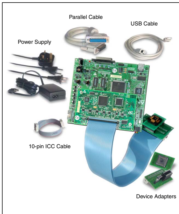
Figure 1: ST7-DVP3 Emulator

Main Emulation Board – Provides the communication interface with the host PC via parallel or USB connection when working in both the Emulation and ICC configurations. Any Main Emulation Board for the DVP3 series can be adapted to emulate a supported ST7 with the appropriate Target Emulation Board and Connection kit. This board also includes the system's ICC connection, which allows you to connect to the ST7 on your application board via a 10-pin ICC cable and an ICC connector that you install on your application board.