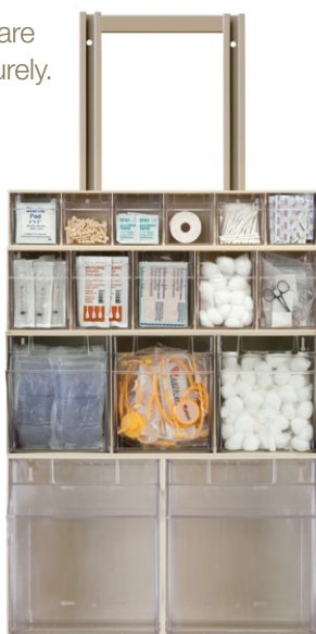
Number of Bins to Fit Each Frame