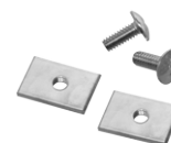
Number of Bins to Fit Each Rail Set