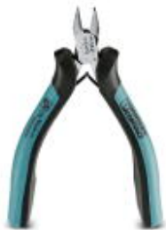
Electronic diagonal cutter, tapered head, angled (21°), without chamfer, with opening spring

Please be informed that the data shown in this PDF Document is generated from our Online Catalog. Please find the complete data in the user's documentation. Our General Terms of Use for Downloads are valid ( http://download.phoenixcontact.com )