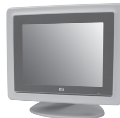
▲ Desktop stand