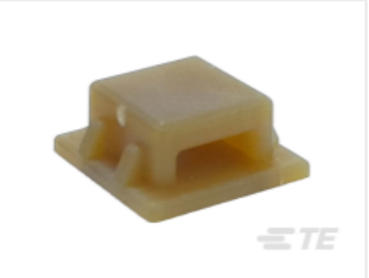
TE Part #2400051-1 CABM-M1