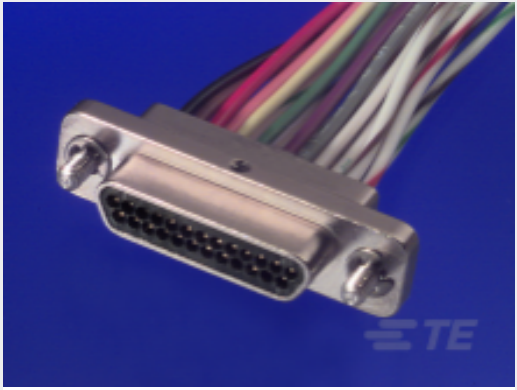
TE Part #1532172-7 M83513/04-B11N, MCKS-N1-B-15S6Q9-18.0