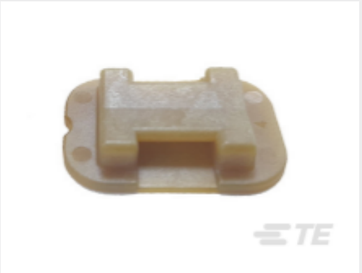
TE Part #2400050-1 CABS-M1