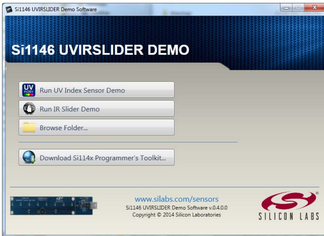
Figure 2. UVIRSLIDER Demo Main Window

Figure 2 shows an example of the UVIRSLIDER Demo main window when connected to the Si1146 UVIRSlider2EK Demo Board.