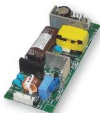
SWF050P-24 50 W