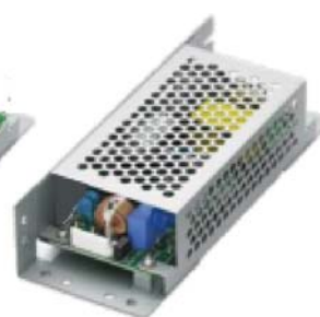
Chassis and Cover