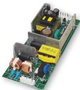
SWF100P-24 100 W