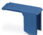
Covering hood, length: 144 mm, width: 41 mm, height: 33 mm, color: blue