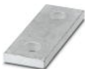
Connection rail, number of positions: 2, color: silver