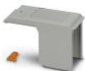
Covering hood, length: 144 mm, width: 41 mm, height: 33 mm, color: gray