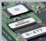
Circuit Board Labeling