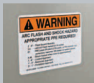
Arc Flash Labeling