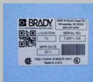
Product Identification Labels