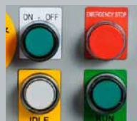
Raised Panel Labeling