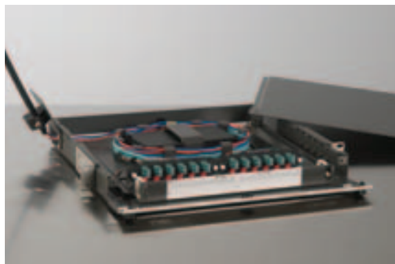
PCH-01U with Cover Off | Photo LAN584