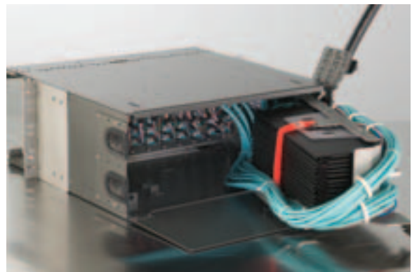
PCH-04U with Splice Option | Photo LAN588