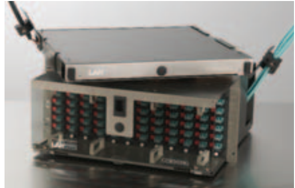
PCH-01U and PCH-04U Housings | Photo LAN585

The PCH-01U housing has a removable top that slides forward with the simple release of two latches, providing unencumbered access to interior components. The drawer slides forward or backward for easy access to the interior after installation.