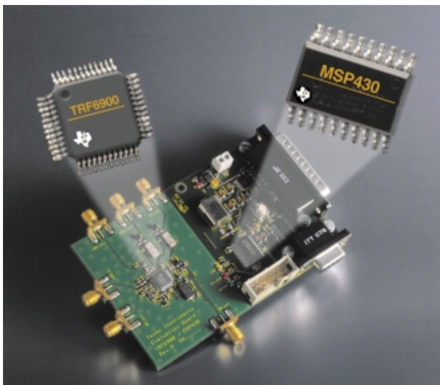
TRF6900/MSP430 Evaluation Kit MSP-EVKTRF6900