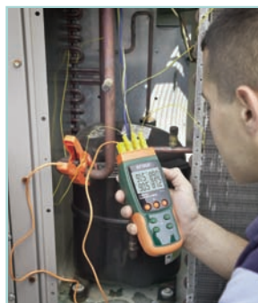
Simultaneously measures 4 temperature inputs for multiple source monitoring