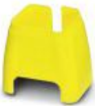
Color marking for patch cable, yellow

Color-coding - FL PATCH CCODE YE - 2891592