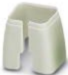
Color marking for patch cable, gray

Color-coding - FL PATCH CCODE GY - 2891699