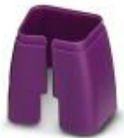
Color marking for patch cable, purple

Color-coding - FL PATCH CCODE VT - 2891990