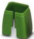
Color marking for patch cable, green

Color-coding - FL PATCH CCODE GN - 2891796