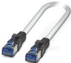
Patch cable, CAT6, pre-assembled, 0.3 m

Please be informed that the data shown in this PDF Document is generated from our Online Catalog. Please find the complete data in the user's documentation. Our General Terms of Use for Downloads are valid ( http://phoenixcontact.com/download )