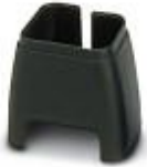
Color marking for patch cable, black

Color-coding - FL PATCH CCODE BK - 2891194