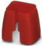
Color marking for patch cable, red

Color-coding - FL PATCH CCODE RD - 2891893