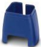
Color marking for patch cable, blue

Color-coding - FL PATCH CCODE BU - 2891291