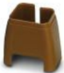
Color marking for patch cable, brown

Color-coding - FL PATCH CCODE BN - 2891495