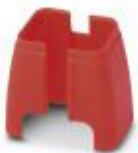
Security element for FL patch cable

Port Guard Security Element - FL PATCH SAFE CLIP - 2891246