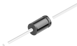
DO-41 Glass case COLOR BAND DENOTES CATHODE