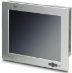
Panel PC with touch screen and software keyboard, 15" display, no slot, Windows XP, German

Please be informed that the data shown in this PDF Document is generated from our Online Catalog. Please find the complete data in the user's documentation. Our General Terms of Use for Downloads are valid ( http://phoenixcontact.com/download )