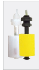
LV35/36 High Temp Float