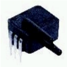
Actual product appearance may vary.

Pressure Sensors: Measurement Type: Absolute; 0 psia to 100 psia Operating Pressure, Constant Current, "AD4" DIP package - Straight Port