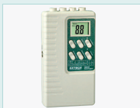
Optional Battery Operated Datalogger