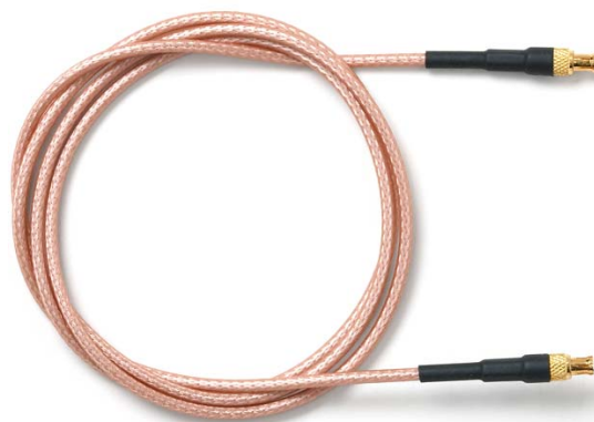
Model 73075-VV MCX Plug to MCX Plug, RG179B/U, 75 Ohm

Snap-on coupling and miniature size for fast connect and disconnect where space is limited