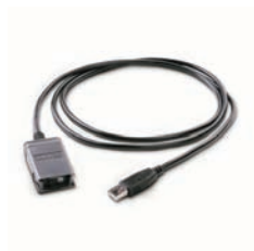
U5481A IR-to-USB cable