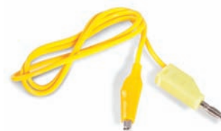
U5402A Yellow test lead for mA simulation

More accessories at: www.agilent.com/find/handheld-calibrator-meter