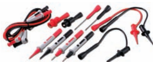
U1168A Standard test lead kit