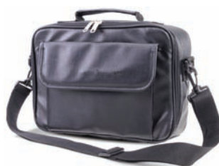
U5491A Soft carrying case