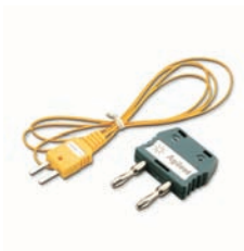
U1186A K-type thermocouple and adapter