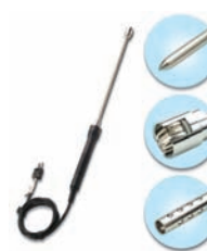
U1181A Immersion temperature probe