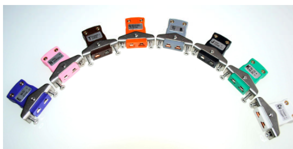
'Stainless steel panel mounting bracket'