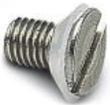
Sealing screw, for IP65 protection

Sealing screw - HC-D 7-DS-IP65 - 1686229