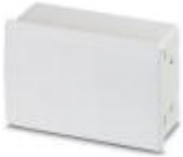
Replacement cover for base unit