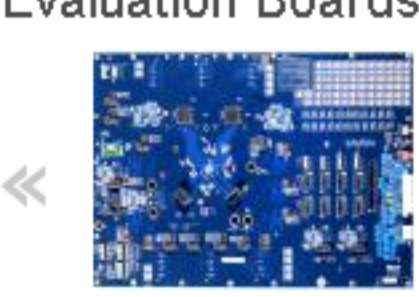
Evaluation Board SDK for the 89H16NT16G2

GET TECHNICAL SUPPORT CONTACT SALES OFFICE