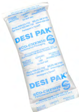
13843 & 13844

In order to provide a complete moisture barrier packaging assembly, desiccant must be inserted into the bag, prior to having the bag vacuum sealed. The recommended amount of desiccant is dependent on the interior surface area of the bag to be used. The table is a reference indicating recommended minimum amounts of desiccant that should be used with Moisture Barrier Bags .