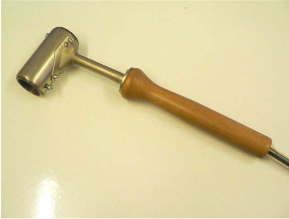
Iron featured without bit