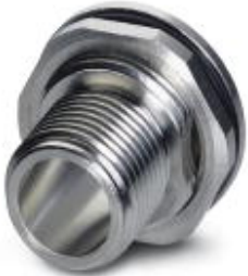
Housing screw connection, Plug, M12, Rear mounting, M15 x 1

Please be informed that the data shown in this PDF Document is generated from our Online Catalog. Please find the complete data in the user's documentation. Our General Terms of Use for Downloads are valid ( http://phoenixcontact.com/download )