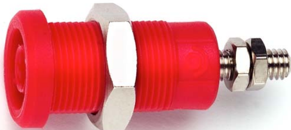
Model 72930 Panel Mount IEC 61010 4mm (0.16in) Jack for Sheathed Plugs