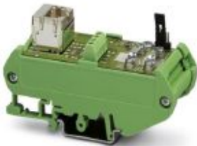
Patch panel for PROFINET, RJ45, DIN rail mounting, IP20, 3 slots, screw connection, CAT5e, option of shielding via jumpers

Please be informed that the data shown in this PDF Document is generated from our Online Catalog. Please find the complete data in the user's documentation. Our General Terms of Use for Downloads are valid ( http://phoenixcontact.com/download )