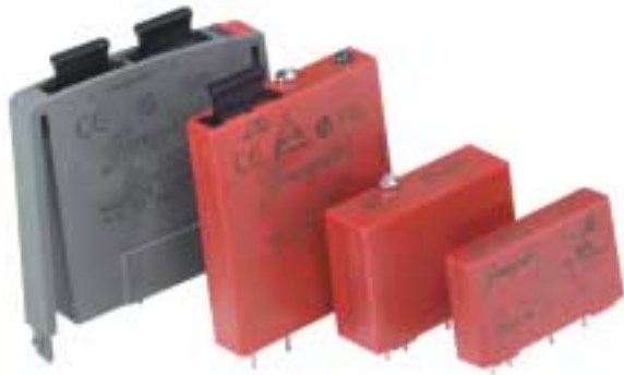
70L-ODC 70G-ODC 70-ODC 70M-ODC