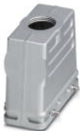
HEAVYCON sleeve housing B16, for double locking latch, height 76 mm, with thread M25, straight cable outlet, EMC version

Please be informed that the data shown in this PDF Document is generated from our Online Catalog. Please find the complete data in the user's documentation. Our General Terms of Use for Downloads are valid ( http://download.phoenixcontact.com )