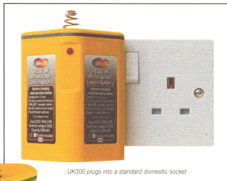
UK300 plugs into a standard domestic socket