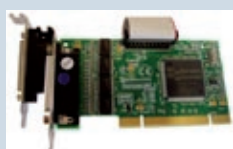
UC-263 LP uPCI 4xRS232 + LPT Printer Port