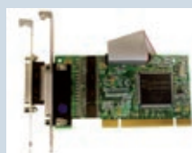
UC-295: uPCI 4xRS232 + LPT Printer Port