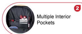
Multiple Interior Pockets