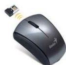
Micro Traveler 900S