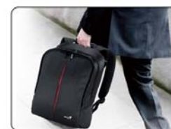
Suitable for a business trip or daily commute