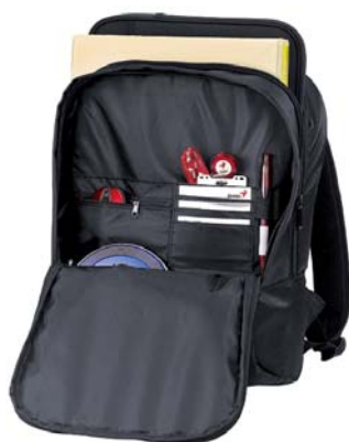
Multiple interior pockets