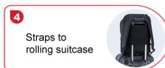
Straps to rolling suitcase