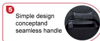
Simple design concept and seamless handle