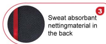
Sweat absorbant netting material in the back