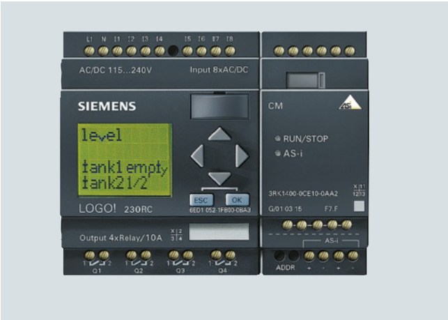
AS-Interface connection for LOGO!

Every LOGO! can now be connected to the AS-Interface system