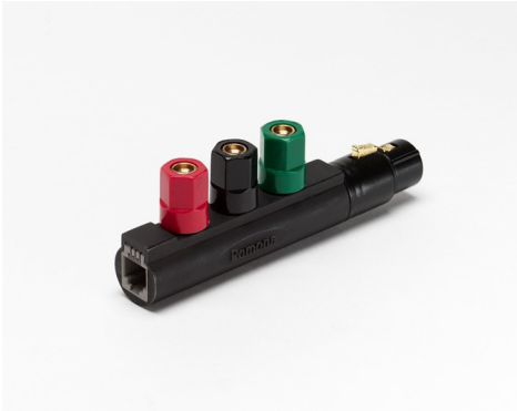
Model 7289 XLR (F) / Triple Binding Post / RJ11