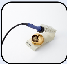
Stand with Tip cleaner #633-01