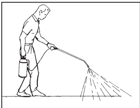
Figure 2. Compressed air sprayer in use.

Note: It is extremely important to obtain uniform coverage. Uneven application may result in uneven soil protection.