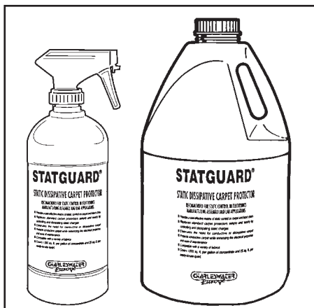
Figure 1. Statguard® Carpet Protector 70995 1 litre trigger spray ready to use for dry application 70996 3.8 litres concentrate