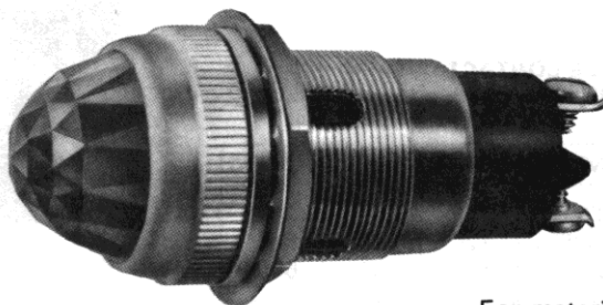
103-3502-1331-403 Torpedo Faceted lens

For materials and finishes of products in this group, see preceding page.