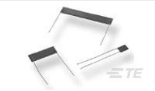
TE Part #1625960-4 HBA RE 15M 1% 100PPM