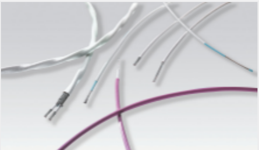
TE Part #CAT-55PC-NC-H22 Hookup Wire: Nickel Coated Copper Wire, 22 AWG