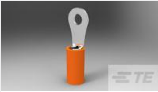
TE Part #50834 TERMINAL,PIDG PTFE R 18-16 4