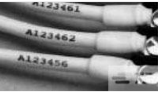
TE Part #5053154018 RNF-100-3/8-2-SP