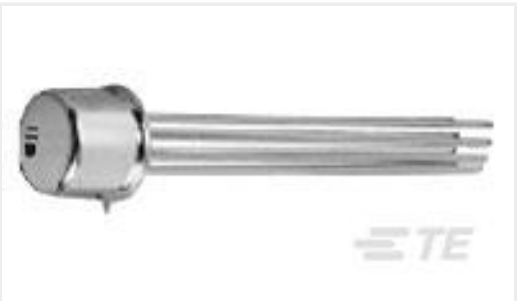
TE Part #1617128-2 JMCD-12XM = M39016/16-035M