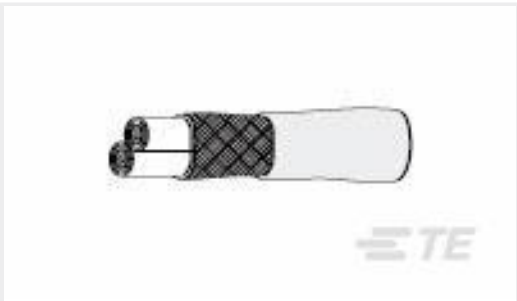
TE Part #3822873005 44A1121-20-2/6-9