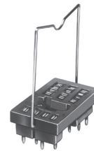
Hold down spring