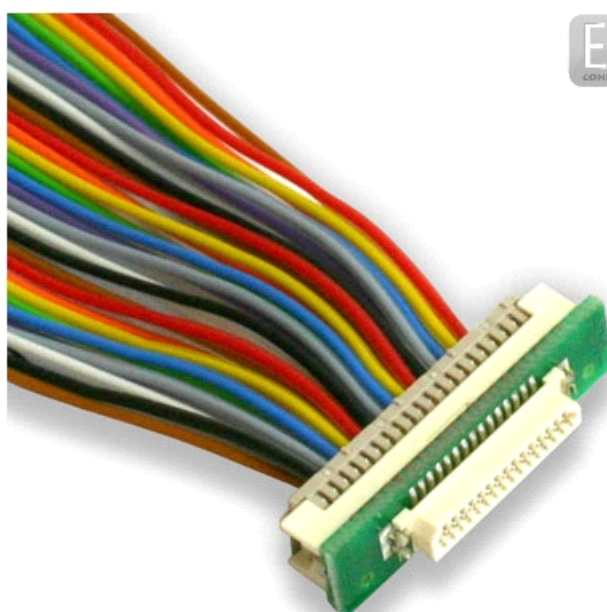
Adapterset for DF9-31S-1V

In the absence of confirmation by device specification sheets, ES&S Oliver Reiners takes no responsibility for any defects that occur in equipment using any of ES&S's devices, shown in catalogs, data books, etc. Contact ES&S in order to obtain the latest device specification sheets before using any ES&S's device. ES&S reserves the right to make changes in the specifications, characteristics, data, materials, structures and other contents described herein at any time without notice in order to improve design or reliability. Contact ES&S in order to obtain the latest specification sheets before using any ES&S's device. Manufacturing locations are also subject to change without notice. Observe the following points when using any device in this publication. ES&S takes no responsibility for damage caused by improper use of the devices. ES&S's devices shall not be used for equipment that requires extremely high level of reliability, such as: -Military and space applications -Nuclear power control equipment -Medical equipment for life support