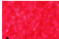
Example of "Textured" finish