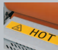
General ID ...and many more!