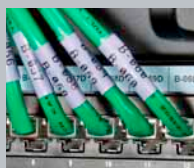
Voice & Data Communications