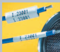
PermaSleeve® Wire Marking Sleeves