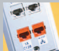
Patch Panel & Faceplates